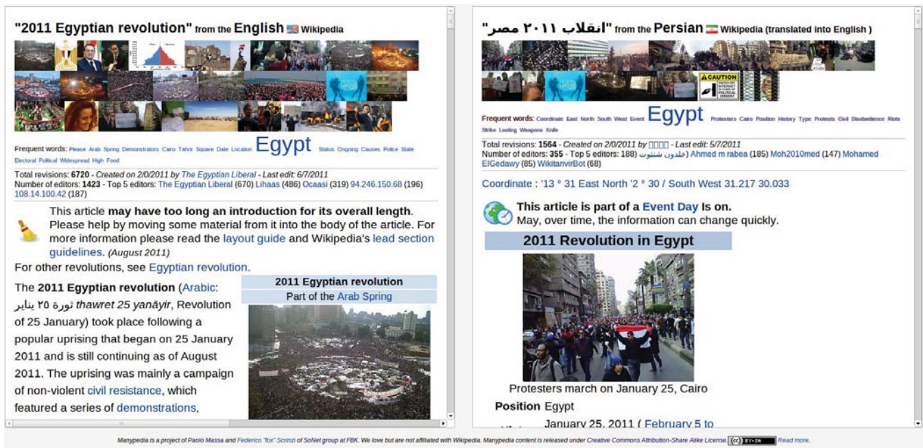
Figure 1. Pages about “2011 Egyptian revolution” from English (left) and Persian (right) Wikipedia compared using Manypedia [21]. Manypedia automatically translates pages into a language chosen among 56 different languages and adds additional descriptive information such as most frequent words, number of edits and editors, creation date, top editors and images used in the article.

perspectives provided by traditional theoretical research with a different point of view.